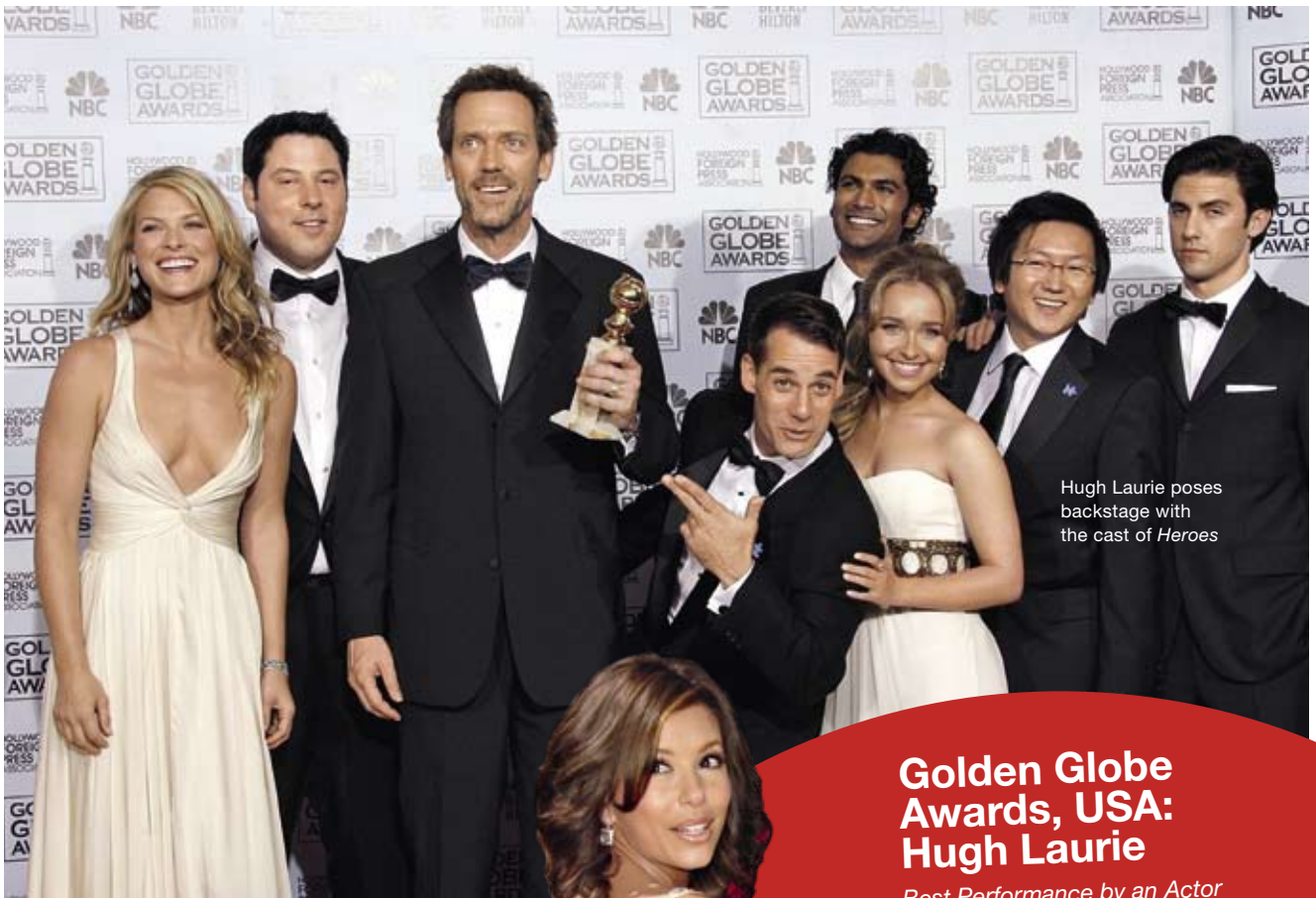
Hugh Laurie poses backstage with the cast of Heroes