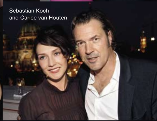
Sebastian Koch and Carice van Houten